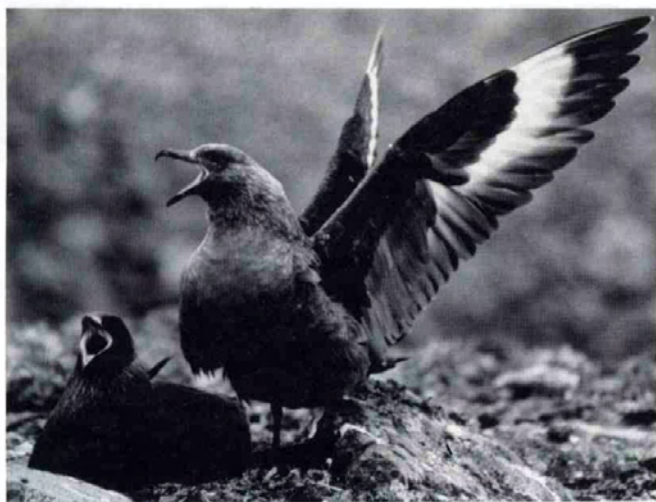
Antarctic Brown Skua