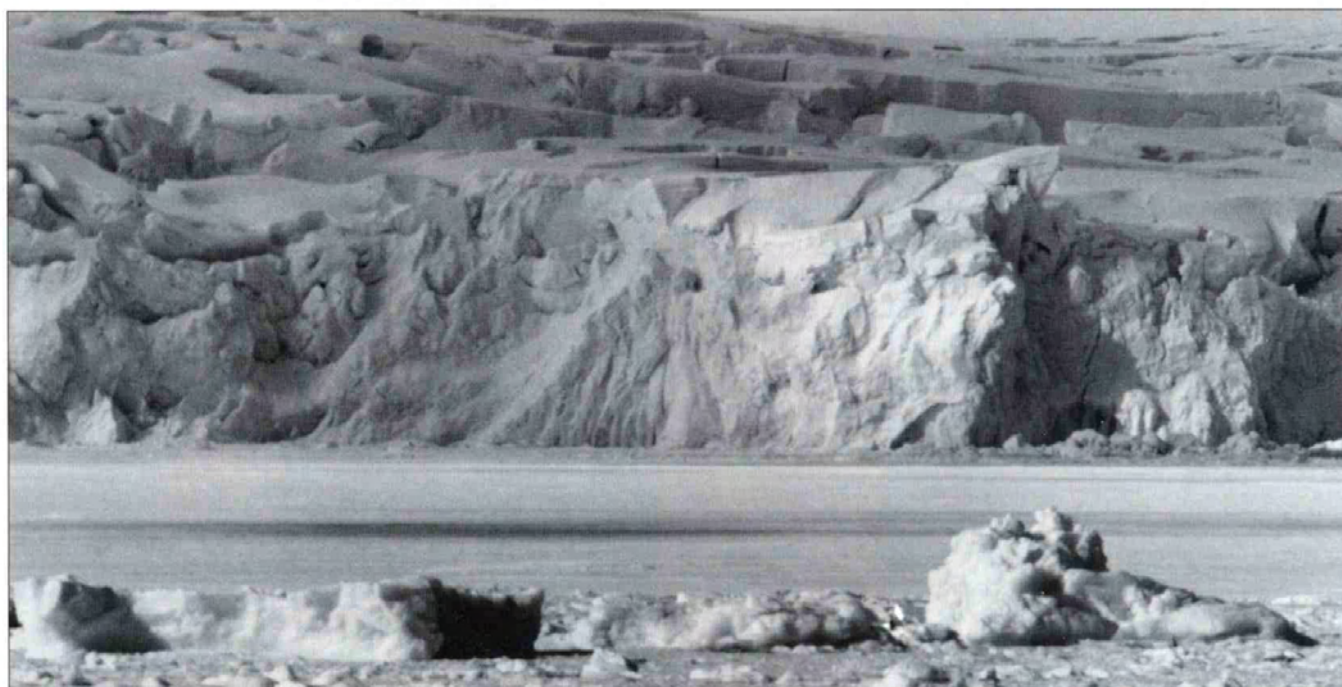
Anvers Island Panorama