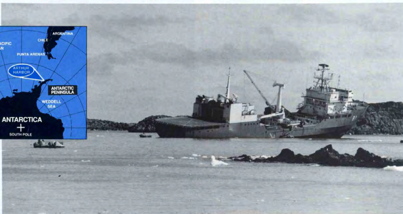
Bahia Paraiso on the rocks in Arthur Harbor