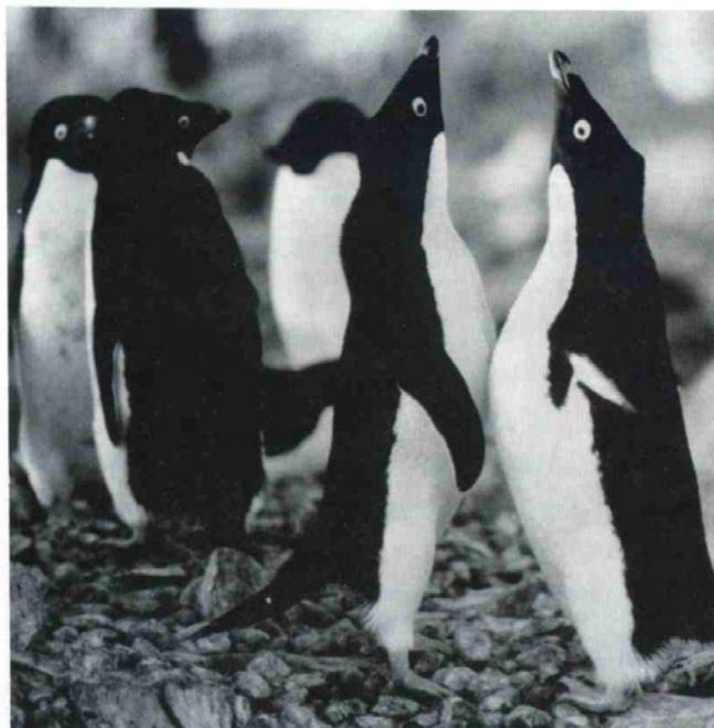
Adelie Penguins at Torgersen Island