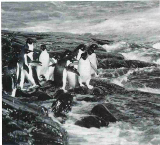
Romping Adelie Penguins