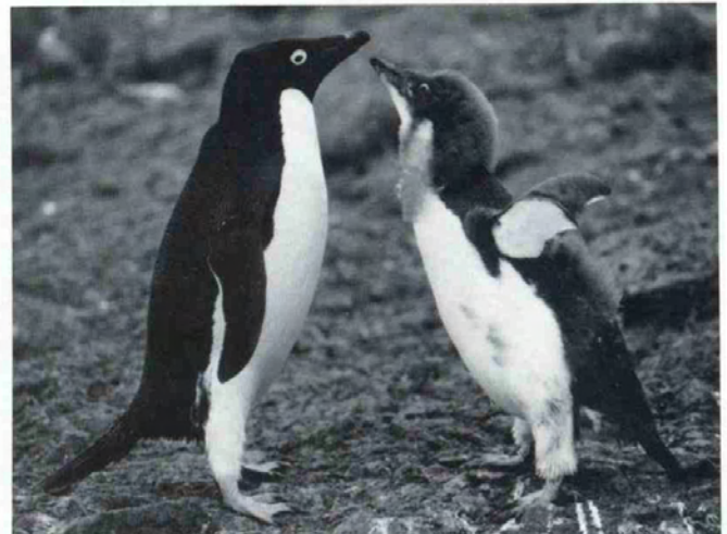
Adult with soon-to-fledge chick